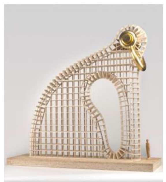
Martin Puryear, Maquette for Big Bling, 2014. Birch plywood, maple, 22-karat gold leaf, 40 1/4 x 9 1/8 x 40 in. (maquette); 40 x 10 x 38 ft. (projected size). Collection of the artist. © Martin Puryear.

Pascale and Fine limit their remarks about specific art works to materials and processes and do not directly address the ways that Puryear codes references to race, gender, and culture in his work. Despite this important omission, Pascale draws connections among many works, such as the source for Puryear's first (and recent) uses of the 'liberty' Phrygian cap, a conical red cap with a soft, forward-curling tip. The racial symbolism is obvious in a 1794 image of a dark-skinned boy in the Phrygian cap, titled "Moi Libre aussi" (I'm free too) and in a series titled "Untitled" and "Shackled," with its visual reference to slavery. Puryear's untitled drawings and maquette a work titled Big Bling for Madison Square Park is another work that suggests that the whole legacy of slavery was treating people like property. Puryear has also used tar in some work; his clear and ongoing attention to racial injustice as an unresolved part of America's history is an important –ironically somewhat overlooked — part of his legacy as an artist.